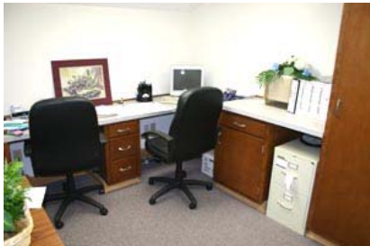
LEFT: A peek inside one of our state-of-the-art offices.